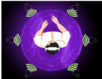
QSurround Audio Experience