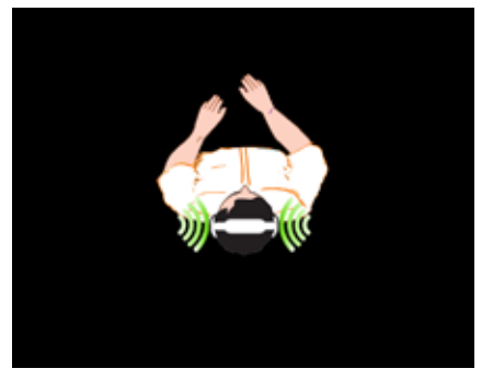
Ordinary Audio Listening