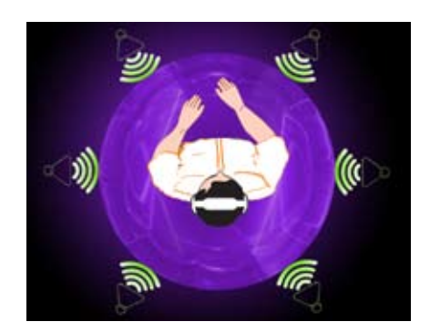
QSurround Audio Experience