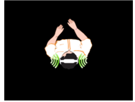
Ordinary Audio Listening